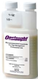
Onslaught Microcap No residual insecticide works better.