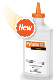
PyGanic Dust Botanical with fast kill and flushing.