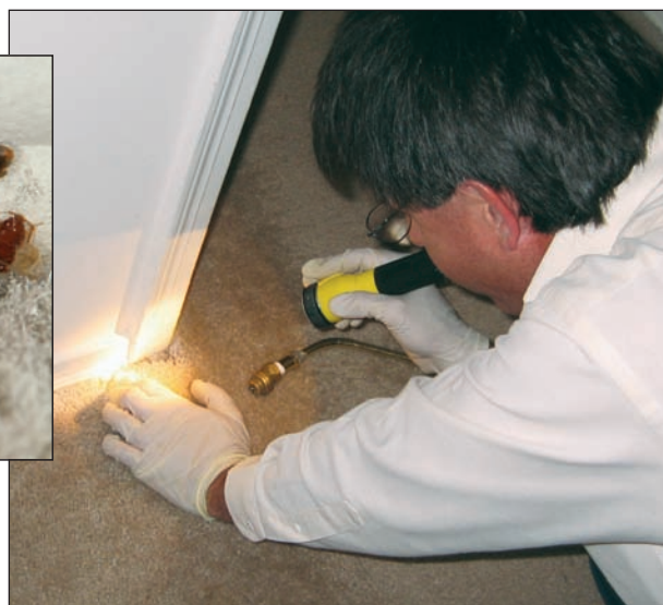
(Right) Bed bugs often hide along the edges of carpeting. A pest management professional performing an inspection. (Above) A close up of bed bug eggs, nymphs and adults.

While the aforementioned measures are helpful, insecticides are important for bed bug elimination. Professionals treat using a variety of low-odor sprays, dusts and aerosols. Baits designed to control ants and cockroaches are ineffective. Application entails treating all areas where the bugs are discovered or tend to crawl or hide. This may take hours of effort and follow-up visits are usually required.