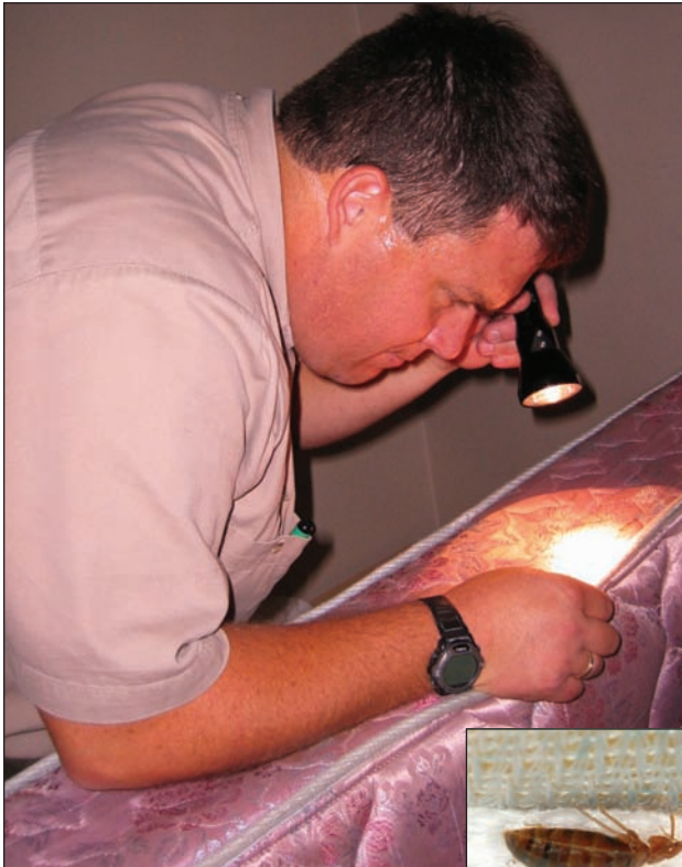
Bed bugs often congregate along the seams of mattresses.