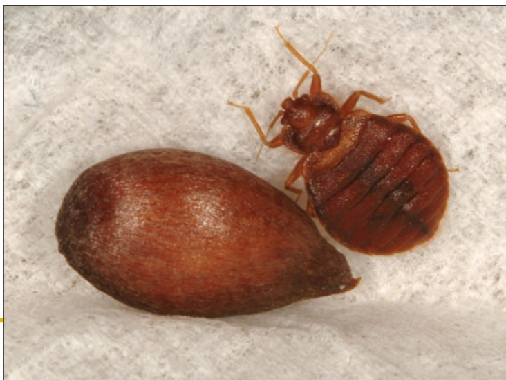
(Right) An adult bed bug is slightly smaller than an apple seed.

HOW INFESTATIONS BEGIN. It often seems that bed bugs arise from nowhere. The bugs are efficient hitchhikers