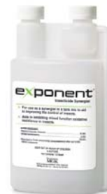
exponent Synergist Enhances efficacy, combats MFO resistance.