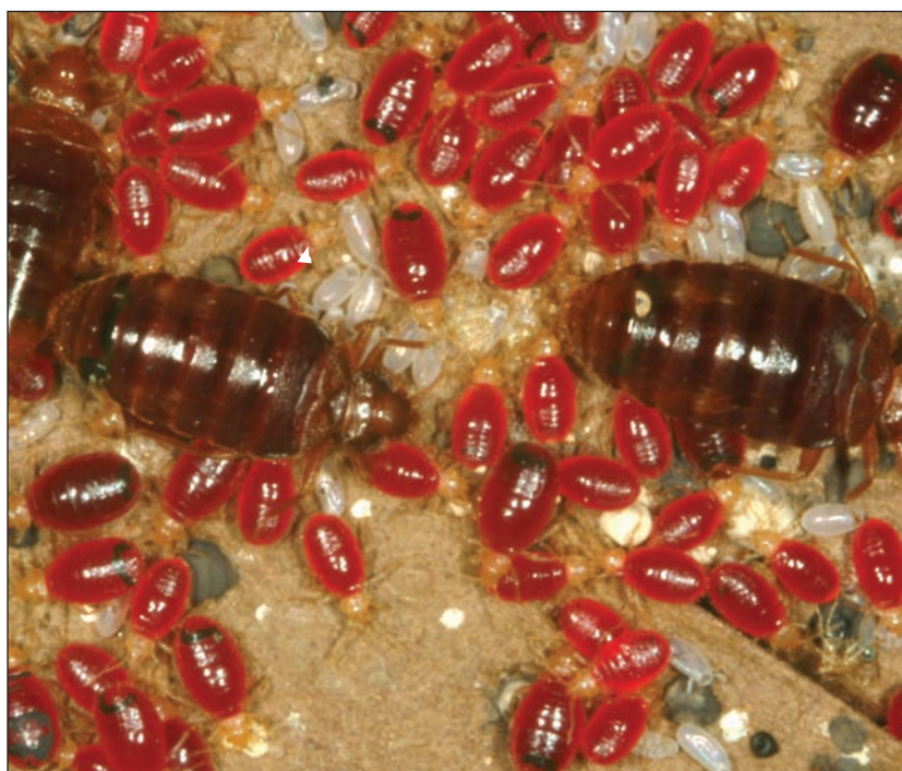
Adult bed bugs, young nymphs and eggs. Photo was taken just after feeding.