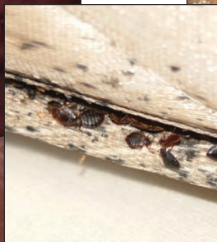
Bed bugs are often found within the seams, tufts and folds of couches, as well as on the underside of box springs and along the seams of mattresses. The blackish spots are excrement.